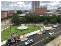
City of Montgomery | "Rotary Park, Downtown Montgomery"