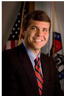
Mayor Walt Maddox, City of Tuscaloosa