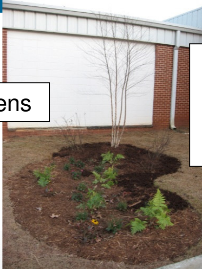
Best Management Practices