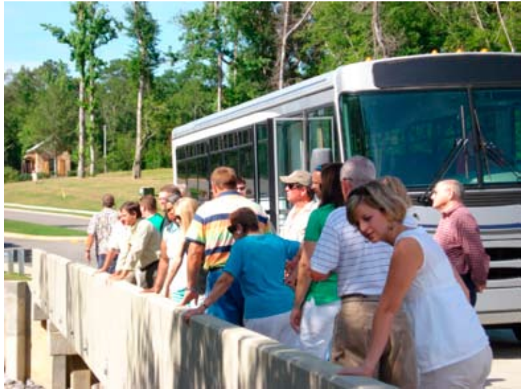
Planning Commission members, Environmental Advisory Board members and Baldwin County Commission staff view a bridge and wetlands in the Whitehouse Creek Plantation subdivision off Bromley Road in Planning Districts 4, 7 and 9.

Attendees were also able to experience riverine wetlands at Byrnes Lake, and depressional wetlands at a Grady Pond in Summerdale and Interdunal Swales in the Fort Morgan area. The Natural Resource