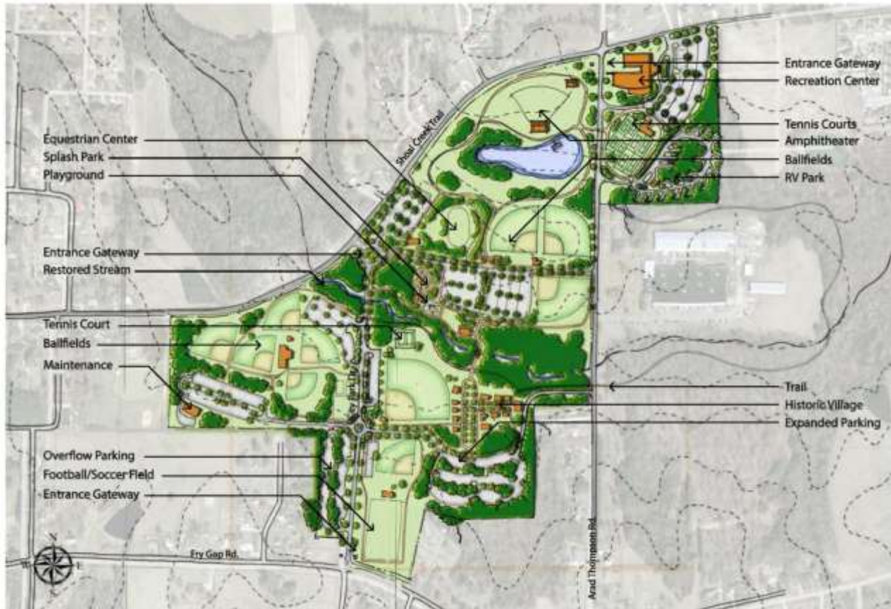
Figure 7 - Master Plan